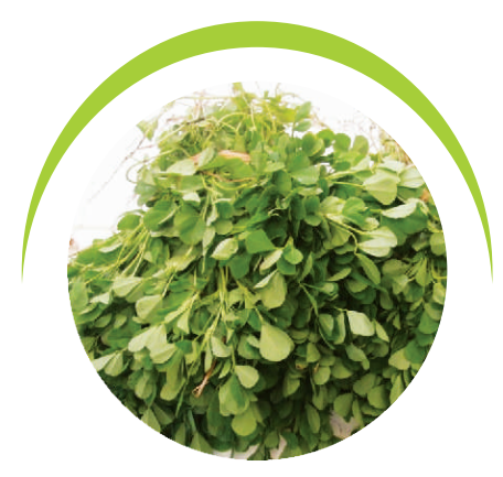
FENUGREEK LEAVES (METHI) 50-60g BLOCK