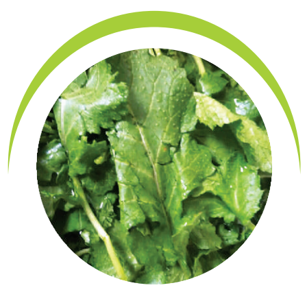
MUSTARD GREEN (SARSON) 50-60g BLOCK