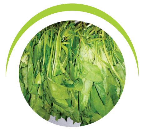
SPINACH (PALAK) 50-60g BLOCK